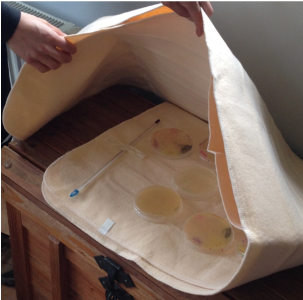
Fig. 3: low cost setups for growing bacterial plates. Bed-heating device (USD 20).

We also combined this method with Gibson assembly for multigene construction. Once transcriptional units have been assembled by Golden Gate, PCR-based assembly are used for building multigene constructs (Torella et al., 2014). We are optimising the entire protocol to use the fewest number of expensive equipment or replace them with low cost alternatives. For instance, we have adapted bed-heating blankets for growing bacteria overnight and successfully used methods of DNA transformation that doesn't require refrigeration of cells (Fig. 3).